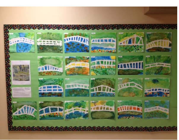
Kindergarteners' bridges in the style of Monet.